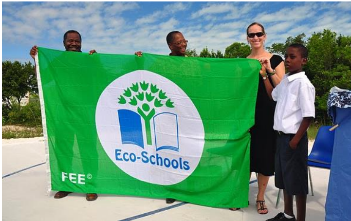
Deep Creek Middle School, 2010 First recipient of Green Flag Award In The Bahamas